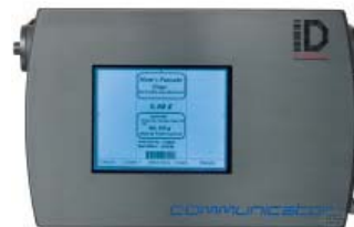
Unicontroller for harsh environments