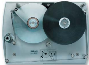
Simple, robust design makes the COMMUNICATOR maintenance free