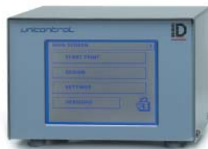
Standard 5.7" LCD touch screen Unicontroller