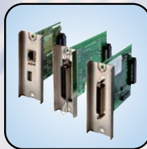
Plug-In Interface Modules