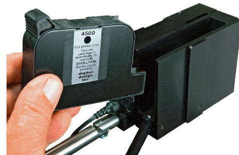
Ink Cartridge and Printhead Module