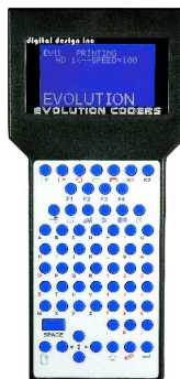
Universal Hand Held Controller