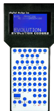
EVOLUTION Universal Controller

Complete PC control of the EVOLUTION I network through our EVOLUTION-NET software is available as an option.